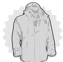
MATCHING JACKETS - PAGE 60