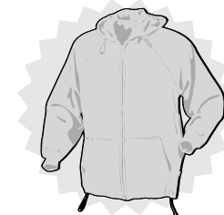
MATCHING JACKETS - PAGE 32

DOUBLEFACE Two sweatshirt materials, bound together, creates a doubleface material. This gives the garment a "heavier" feeling, nicer finish and a perfect fit, wash after wash. You will feel the difference!